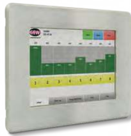
RHINO touch panel